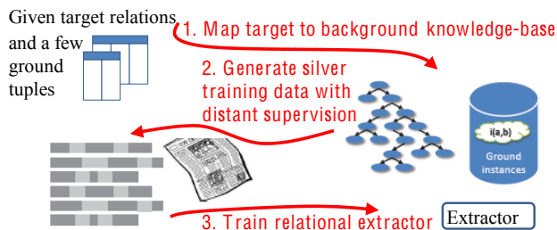
Figure 1: System overview

1 'Silver' because these examples likely contain noise and aren't as valuable as 'gold standard' examples.